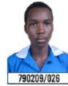
790209/026 WAVAMWINHO LASTON