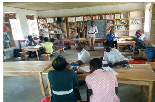
Teacher Professional Day

In addition to the donations above from organizations, sponsorships, scholarships and events, we are unable to list all the generous financial and donations in kind (books, school supplies, teaching aids, clothes, ball etc.). Thank you all for your generous donations.