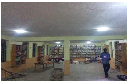
Solar in the Library