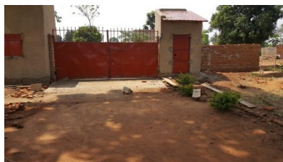
Gate under construction