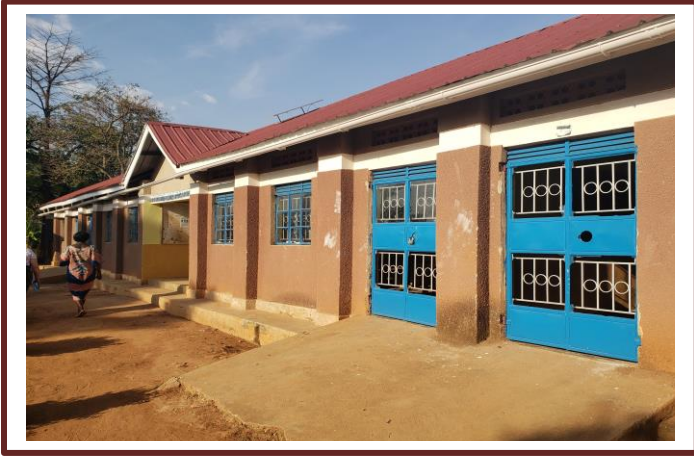
Newly Painted Classroom Building