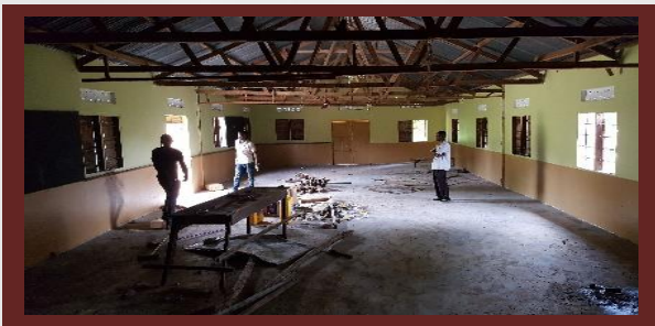
Renovated Kindergarten class

We spent much time preparing our Grade 7 students for their 2018 National Examinations. The exam results came back in mid-January with 25 in Division two and one in Division three. This was an improvement from last year, and we are excited about the progress that is being made in our quality of education.