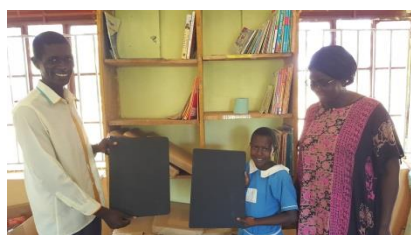
Slates for Kindergarten