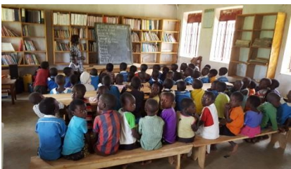
Learning in the Library