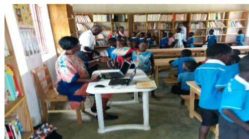
Students Borrowing Books

“Change is the End Result of All True Learning”