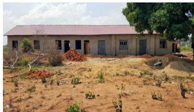
New Dormitory+ Units