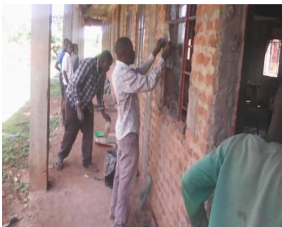
Inserting Window Panes