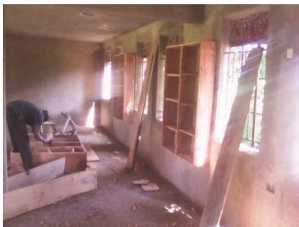
Building Library Shelves

Please invite family and friends and spread the word to make this event a success. For tickets, please contact Phoebe at 905 404 8625 or Sheilagh at 519 539 4525.