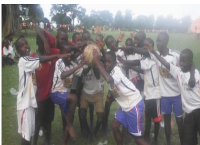
Boys - Area Champions