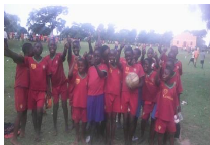
Girls - Area Champions