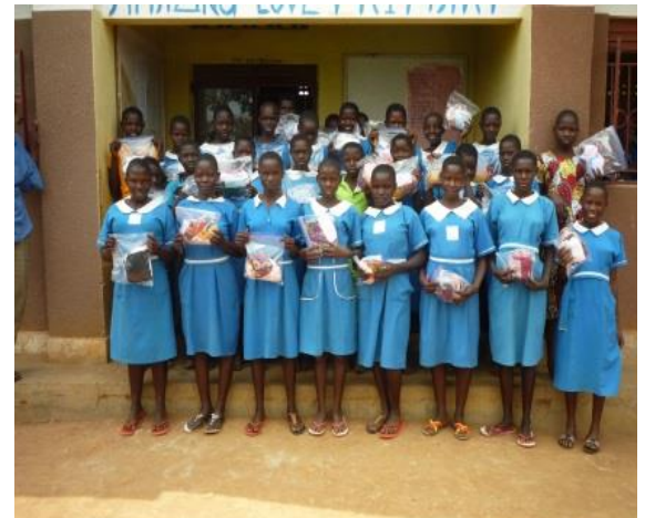
Girls' Sanitary Pads & Under wears