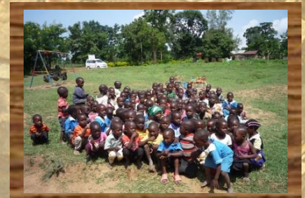
Junior Kindergarten Children

“Education is a powerful “vaccine” against the pandemics of poverty, disease and ignorance”.