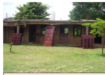
Windows and Doors