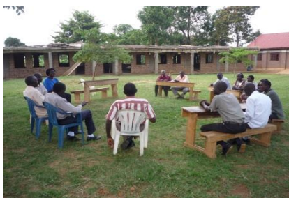
Meeting With School Boards