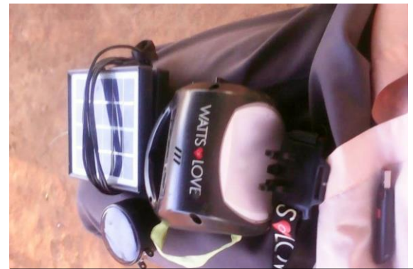
Solar Radio Unit- Watts of Love

Teachers wanted some help with the assessment strategies. James was a great resource in helping teachers to broaden the number of strategies they use in assessment. Some of the strategies were implemented immediately.