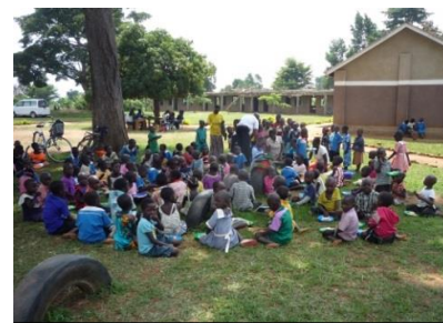
Meal for Kindergarten